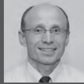
Pr Klaus Busam New York, USA